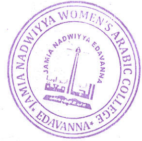
Principal JNW Arabic College Edavanna - 676541