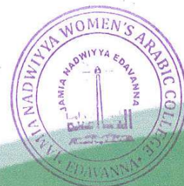
Principal JNW Arabic College Edavanna - 676541